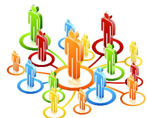
Relationship Systems Intelligence